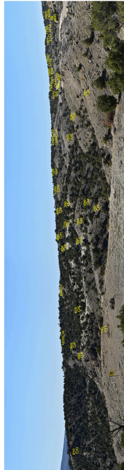
LRP Target Map